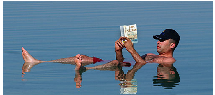
MAN BATHING IN THE DEAD SEA

That's right; at the beach you receive the full benefits of the sea with its high concentrations of magnesium in the water and iodine in the air, which is taken up by the lungs. It actually takes quite a bit of magnesium chloride flakes in a bath to bring bathwater up to the concentration of ocean water, but it is well worth the effort and expense for the health benefits are spectacular.