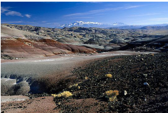
BETONITE HILLS UTAH

When it comes to using the skin there are many options. Bentonite clay can be used to literally suck the poisons through the skin and this can be enormously helpful while making overall treatments more effective and safe. The proof of this method of drawing poisons through the skin is not in the scientific literature but in the ring around the tub.